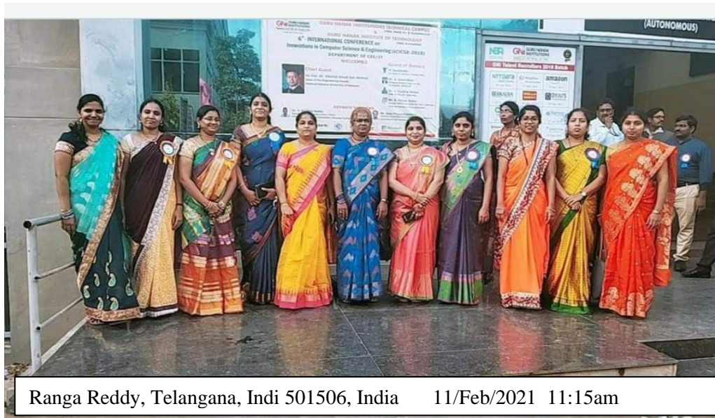
Ranga Reddy, Telangana, Indi 501506, India 11/Feb/2021 11:15am

Workshop on Gender Socialization “A process to modify the Society” was conducted in GNIT on 11-02-2021. The entire women faculty was participated in the program. This program was focused towards addressing issues of personal health care, vaccination, hygiene, and illness prevention for women.